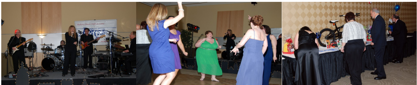
Gala attendants enjoy live music by JoyRide, dancing, dinner, and a silent auction at the 2011 Gala For Hope fundraiser.