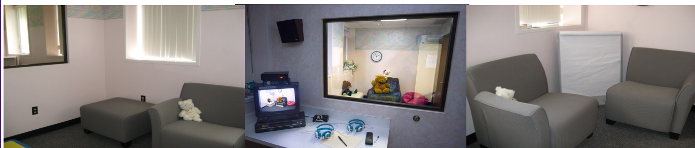
The CAC's interview room provides a safe and child-friendly place for children to talk about their experiences while other important members of the investigative team observe.

The forensic interview is one of the most important standards that CACs have to meet, obtaining a statement from a child in a developmentally and culturally sensitive, unbiased manner that will support accurate and fair decision making. Forensic interviews are also designed to produce evidence that will stand up in court. The forensic interview aims to make a child more comfortable discussing upsetting experiences, and therefore these interviews, many times, mark the beginning of the healing process for children and their families.